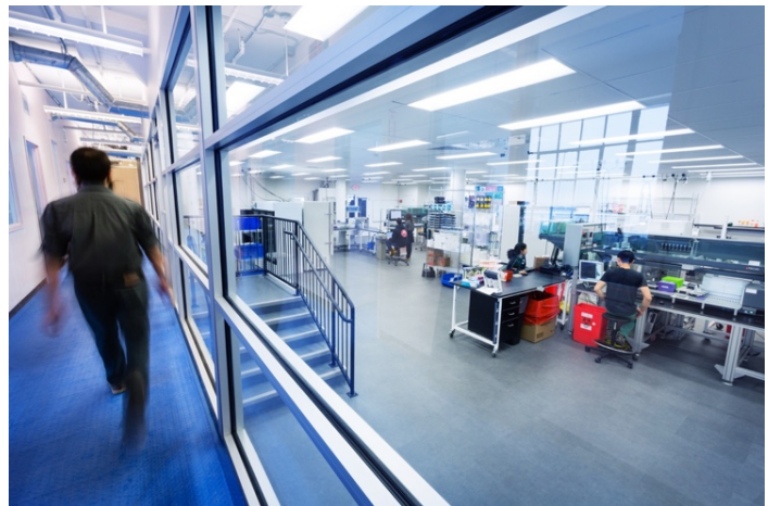
Figure 1: Ginkgo Bioworks' organism foundry: Bioworks1

To date, much of biological research has been done in what is effectively an artisanal process. Apprentices study for years under a master to learn the techniques and approaches needed to perform biological research. Indeed, technically skilled biologists are often said to have “good hands.” At Ginkgo, we take an engineer’s approach to biological design. We apply software, automation and standardization to the process of microbe design and fabrication. This spring, we launched our first foundry for organism design called Bioworks1. Bioworks1